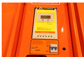
Solar Charge Controller