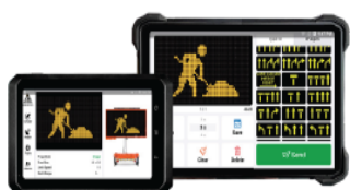
Onsite Tablet Control