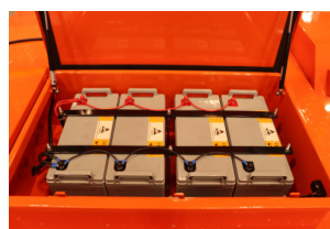
Gel Cell Battery System